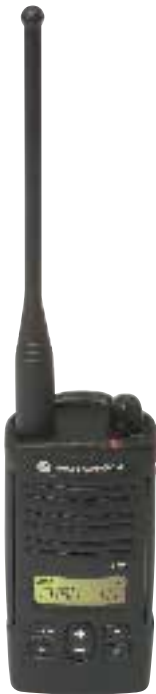
CP110 UHF display