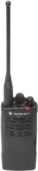
CP110 UHF non-display