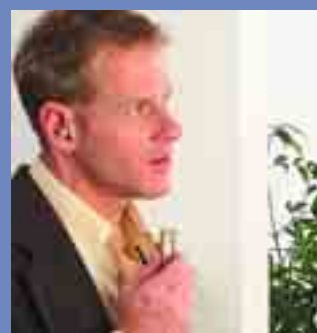
RLN5317A – Beige Two-Wire Comfort Earpiece with Combined Microphone and PTT