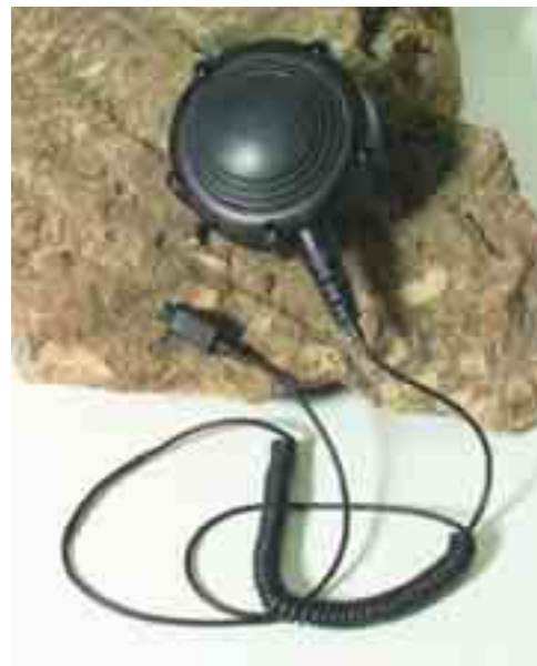
0180300E83 Body Switch Push-to-Talk