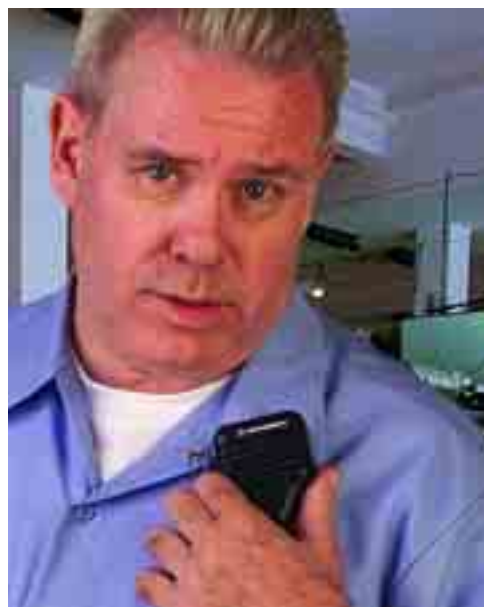
HMN9030A Remote Speaker Microphone

RLN5500A – Accessory Retainer Clip Holds audio accessories securely to radio.