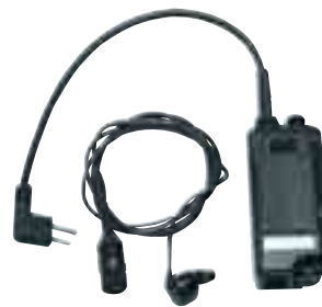
BDN6646C Ear Microphone System, with PTT Interface