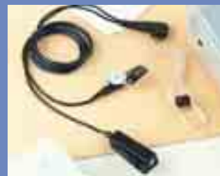
RLN5318A – Black Two-Wire Comfort Earpiece with Combined Microphone and PTT