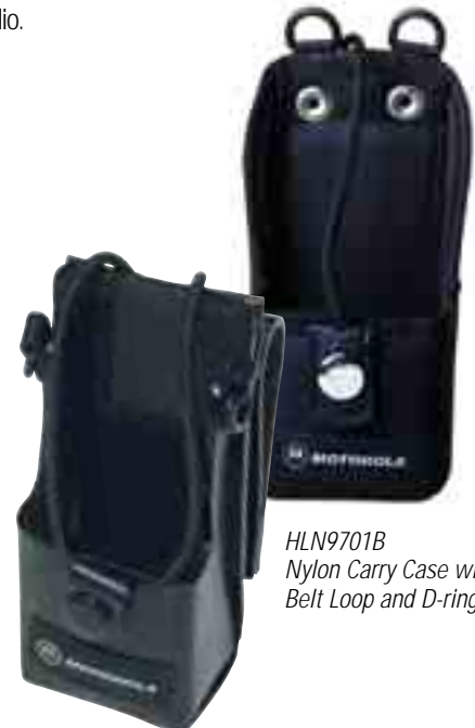
HLN9701B Nylon Carry Case with Belt Loop and D-rings