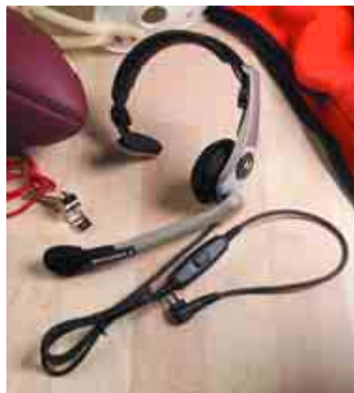
RLN5238A NFL®-Style Lightweight, Single-Muff Headset with In-line Push-to-Talk