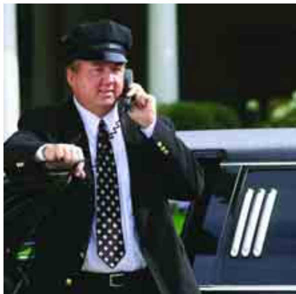
Telephone-Style Handset is ideal for users wanting to conduct private conversations.

Compatible with all Motorola microphones. No installation required.