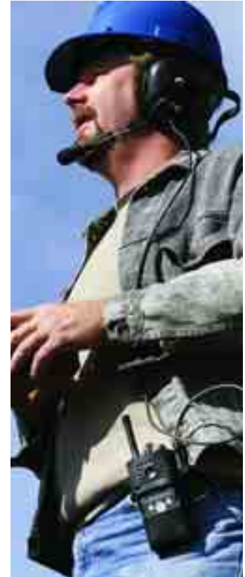
RLN5641A Hard Leather Carry Case with 2.5-Inch Belt Loop

Attaches to D-rings on carry cases to provide added comfort.