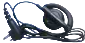
BDN6720A – Black Flexible Ear Receiver

Receive-only earpieces contain a flexible ear loop and speaker worn on the outside of the ear.