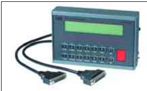
RDN7368A Mobile Display Terminal