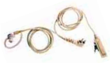
HMN9754D – Beige Earpiece Assembly with Microphone and Combined Push-to-Talk

Two-wire accessory allows users to transmit and receive discreetly.