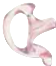
RLN4763A Custom Clear Comfortable Earpiece

Designed to form to the inside of the ear; perfect for low-noise environments. Made of easy-to-clean, chemically-inert hypoallergenic material. Requires NTN8371A Clear Acoustic Tube Assembly and a Motorola Surveillance Kit for operation.