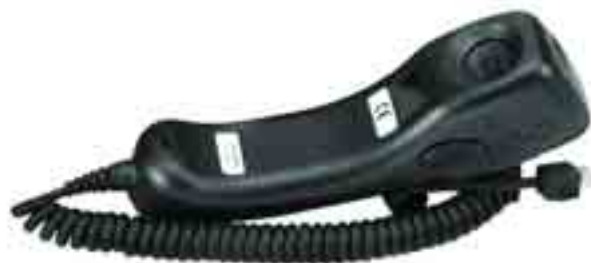
AAREX4617A Telephone-Style Handset